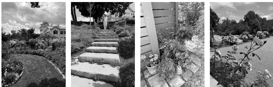
Some of the beautiful gardens in our August garden tour.